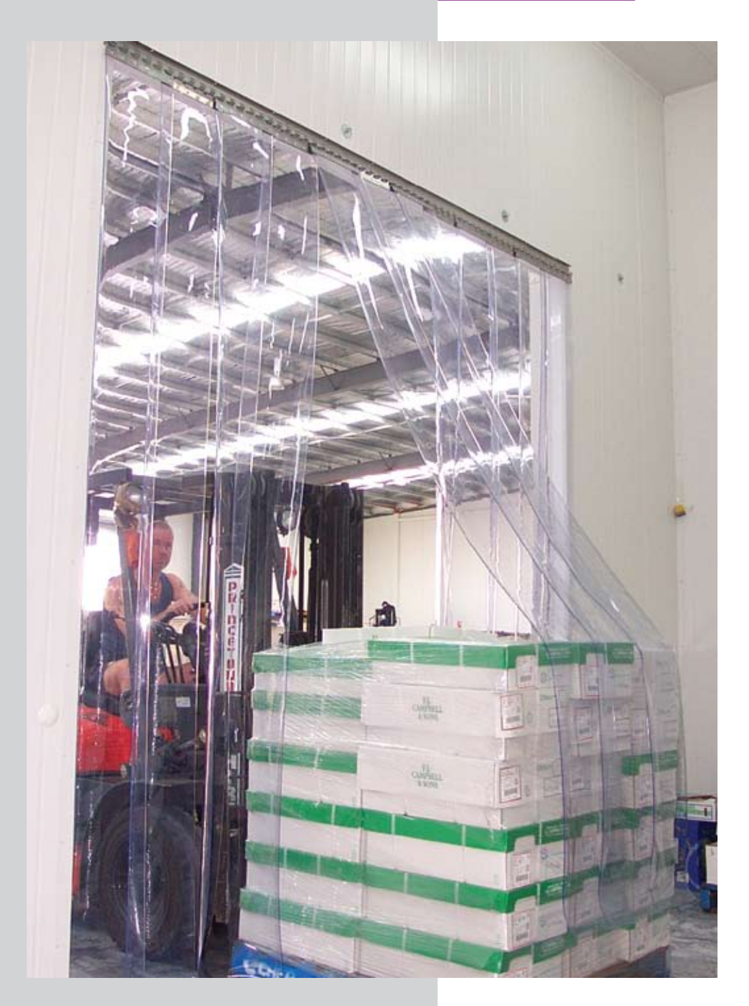
Provides quick and convenient access for medium usage doors