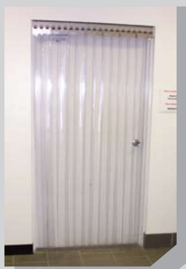
Personnel access stainless steel strip door